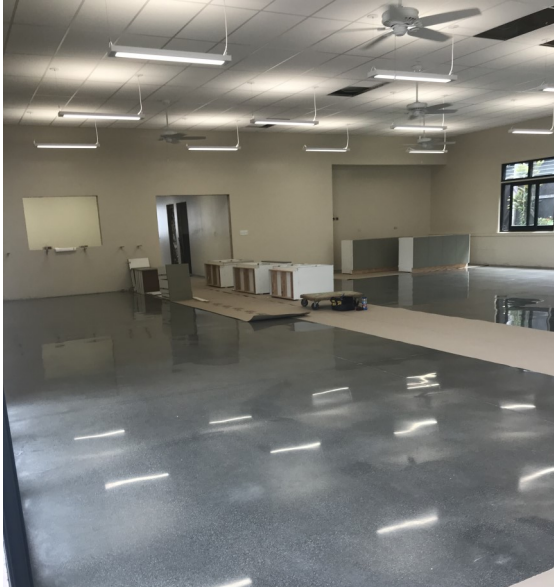
PARISH HALL UPDATE:7/14/2020

The OLS Food Pantry will be distributing food to those in need on SATURDAY, JULY 25, 2020, from 9:00 am to 11:00 am. Volunteers, please come to the Food Pantry (located in the office building drive-way) at 8:00 am to help with set up. Volunteers are also needed for the Senior Box/TANF distributions. Donations for the Food Pantry may be dropped off at the Parish Office during regular business hours. Mahalo to all for the continued support of the OLS Food Pantry!