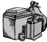
Food Pantry Donations Needed