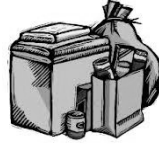
Food Pantry Donations Needed