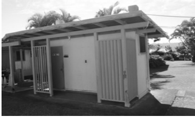
Our Restroom today.

Since the start of the campaign, we have soared to over $712,000. We are so grateful to the 248 families and individuals that have pledged! We still need all of you to make this a success to have NEW RESTROOMS and Parish Hall. Take a look at what we have now: