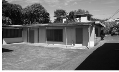
Our Parish Hall today.

It takes all of us to fulfill a NEED to have our Parish flourish for all of us, our children, and our children's children. If you haven't already, please take the time to review how you can contribute with a pledge. Stop by our display after mass on the lanai for information, pledge forms, and envelopes from our volunteers.