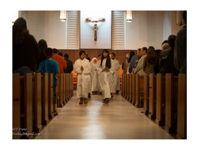
Easter Vigil/ Easter Sunday