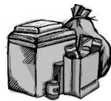
Food Pantry Donations Needed